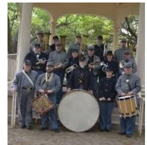
8th Georgia Infantry Band